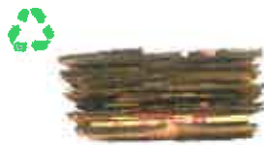
CARDBOARD Dry & Flattened No Food Contact